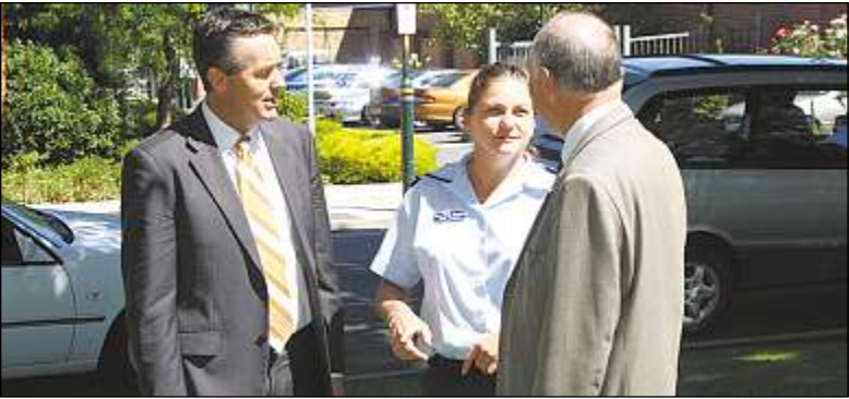
Safer streets: Darren Chester and The Nationals Leader Warren Truss are supporting Traralgon police in their efforts to improve safety on the streets.